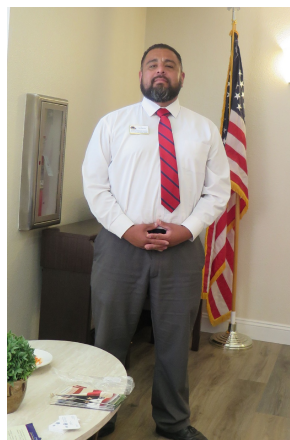
Cemetery Representative, Dixon, VA

No changes in your 2022 Roster this month.