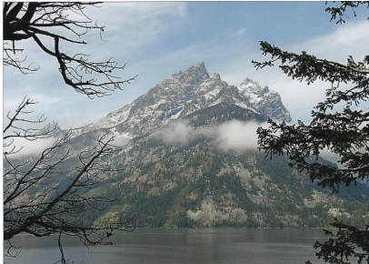
Hal Higgins "The "Grand Teton"