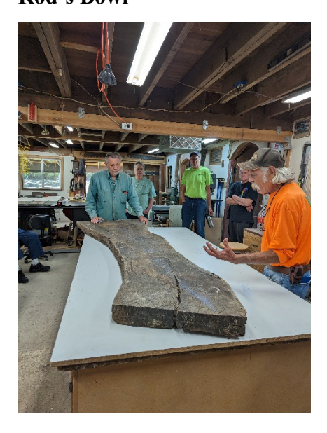
Black Walnut slab