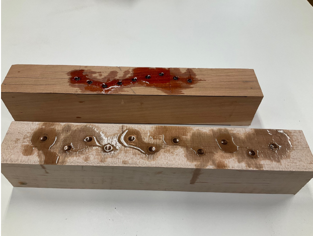
Block with epoxy