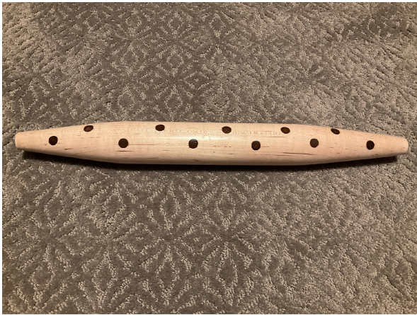
Finished French Rolling Pin