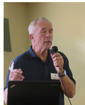
Spoke about Liberty Ships