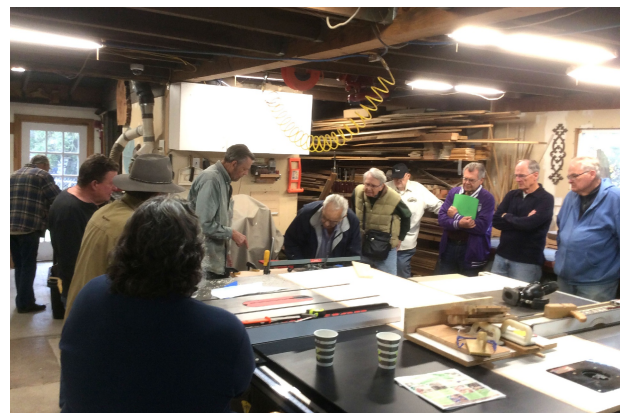
Showing how to fine tune a jointer